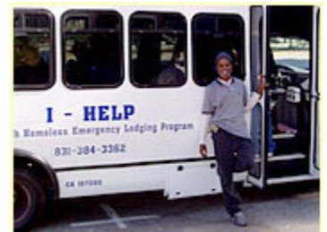
I-HELP men are transported to various churches throughout the county to spend the night.