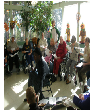
We have such a great time at the convalescent home!

So many people have had great experiences with the convalescent home, and have made some great friends. If you or anybody you know might be interested, just contact Community Outreach for more