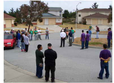
Rebuilding Together, May 3, 2008

Volunteers from Community Outreach assisted with the landscaping, which included weed-whacking, pulling ice plants, raking leaves, removing trash, etc. We had over 60 volunteers from Shoreline Church helping out! Thanks to each and every one of you for your work. Everyone worked extremely hard and the Women's Transitional Housing looks so much better!