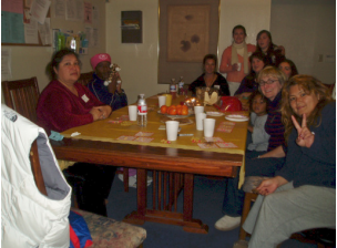
Women's Shelter Visit